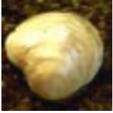
Common jingle shell