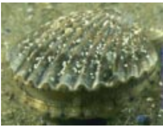
Atlantic Bay Scallop