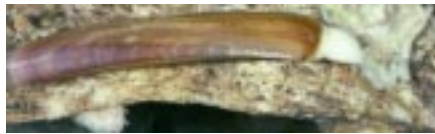
Common Razor Clam