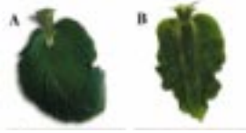
Emerald Sea Slug