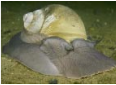
Atlantic moon snail