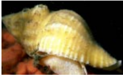
Atlantic Oyster Drill